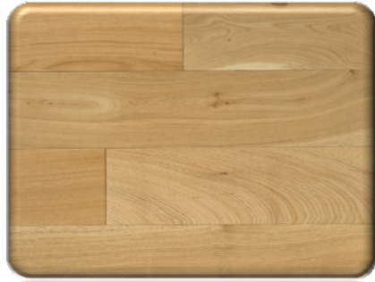
Brushed & Oiled